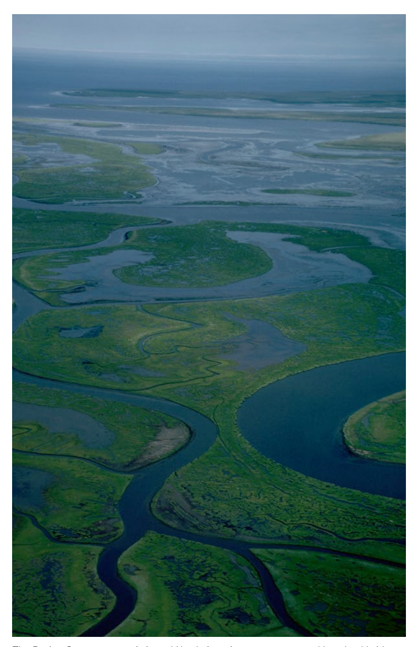
The Bering Sea separates Asia and North America, once connected by a land bridge